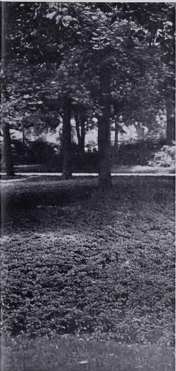
Outdoor Living Room receiving ideal conditions for growth